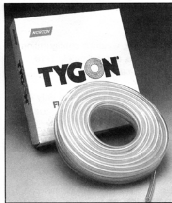
Approximate Outside Diameters